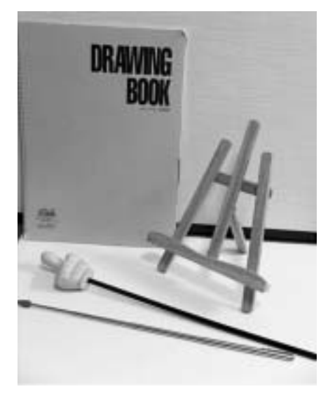
Figure 7. Sketchbook, easel, and two pointers for students to use for their presentation.

The teacher gives a brief oral evaluation of the strong points and what needs to be improved. As homework, students take a photo of their sketchbook page, write an evaluation of the creation of the sketchbook page (see Figure 10) and, after viewing their class performance video, write an evaluation of their presentation (see Figure 11).