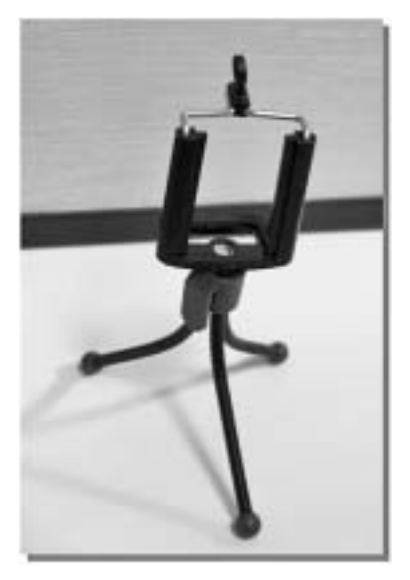
Figure 5. Tripod for student cell phone to record practice presentation.

Then students take their cell phone from the tripod, take out their own earphones, and watch and listen to their presentation while looking at their cheat sheet so they can see what they should improve. They then return to their seats. The whole process of the rehearsal and self-evaluation takes about ten minutes, but for