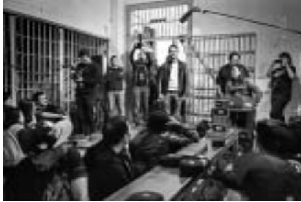
(Image 6) Zedd Surprises Fans with a Party at Alcatraz

ments of environments that made the reputation. Frank Lee Morris and Robert Franklin Stroud were prisoners who created the strong security image of Alcatraz.