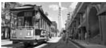
(Image 19) Japanese ramp on train (Big Hero 6)