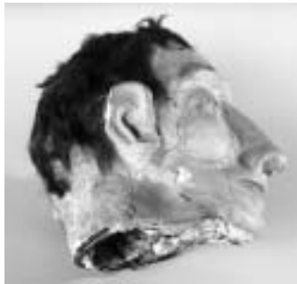
(Image 12) Fake head (Museum collections at The Rock)

to committing crimes. Alcatraz History said that "from his infant years until his teens Morris was shuffled from one foster home to another, and he was convicted of his first crime at the youthful age of only thirteen", and he spent his young life at a training school for boys. He still committed crimes and was imprisoned at other penitentiaries. Eventually, he was incarcerated at Alcatraz and he met the brothers John and Clarence Anglin,