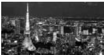
(Image 17) Tokyo (Triple Lights)