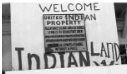
(Image 4) "Welcome to Indian Land" Sign on the Dock ( Museum collection at The Rock )

Indian activists came over and occupied the island. It is obvious from image 4 , and they changed the sign of the island indicating the land belonged to native Indians, and it become as a symbol of Indian protesting.