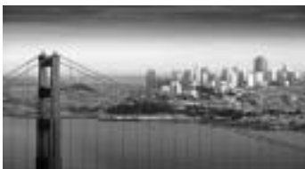
(Image 16) San Francisco