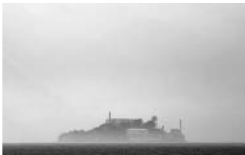
(Image 13) Fog in the bay area

One unique characteristic of San Francisco weather is fog. In summer and winter, there are frequently foggy days. According to the website, Climate of San Francisco Narrative , "Summertime in San Francisco is characterized by cool marine air and persistent coastal stratus and fog, with average maximum temperatures between 60 °F and 70 °F, and minima between 50 °F and 55 °F." Climate of San Francisco Narrative also said: