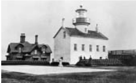
(Image 1) The lighthouse on Alcatraz Island, constructed in 1854, was the first lighthouse activated on the West Coast